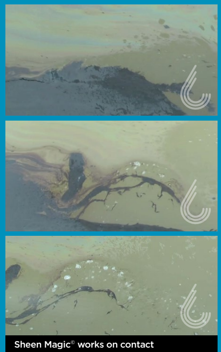
Sheen Magic® works on contact

Depending upon the hydrocarbon chain and the Sheen Magic® volume applied to the contaminated area, the remediation action time may be as short as a few minutes. Normal treatment of severe sheen contamination is completed in hours. No hydrocarbons are emulsified or sink to the bottom as when treated with emulsifiers or detergents.